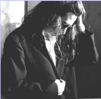
PSA Protective Services for Adults